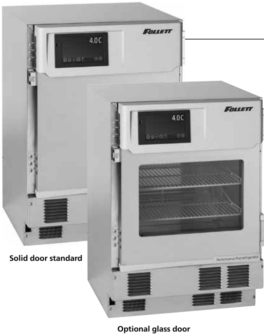
Solid door standard