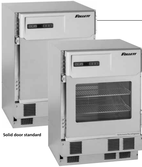
Solid door standard