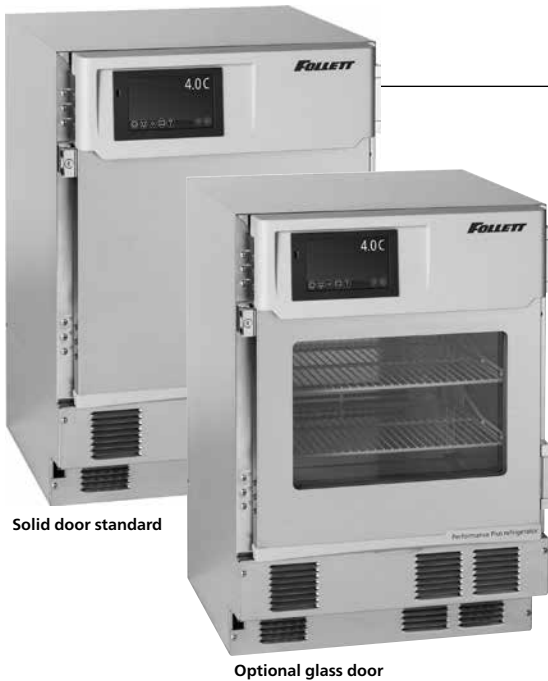
Solid door standard